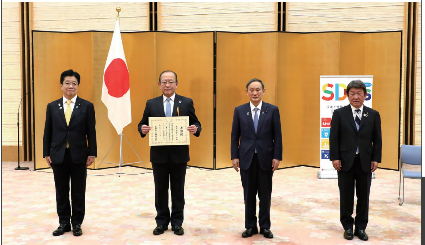
Chief Cabinet Secretary Katsunobu Kato

Source: Official Website of the Prime Minister of Japan and His Cabinet